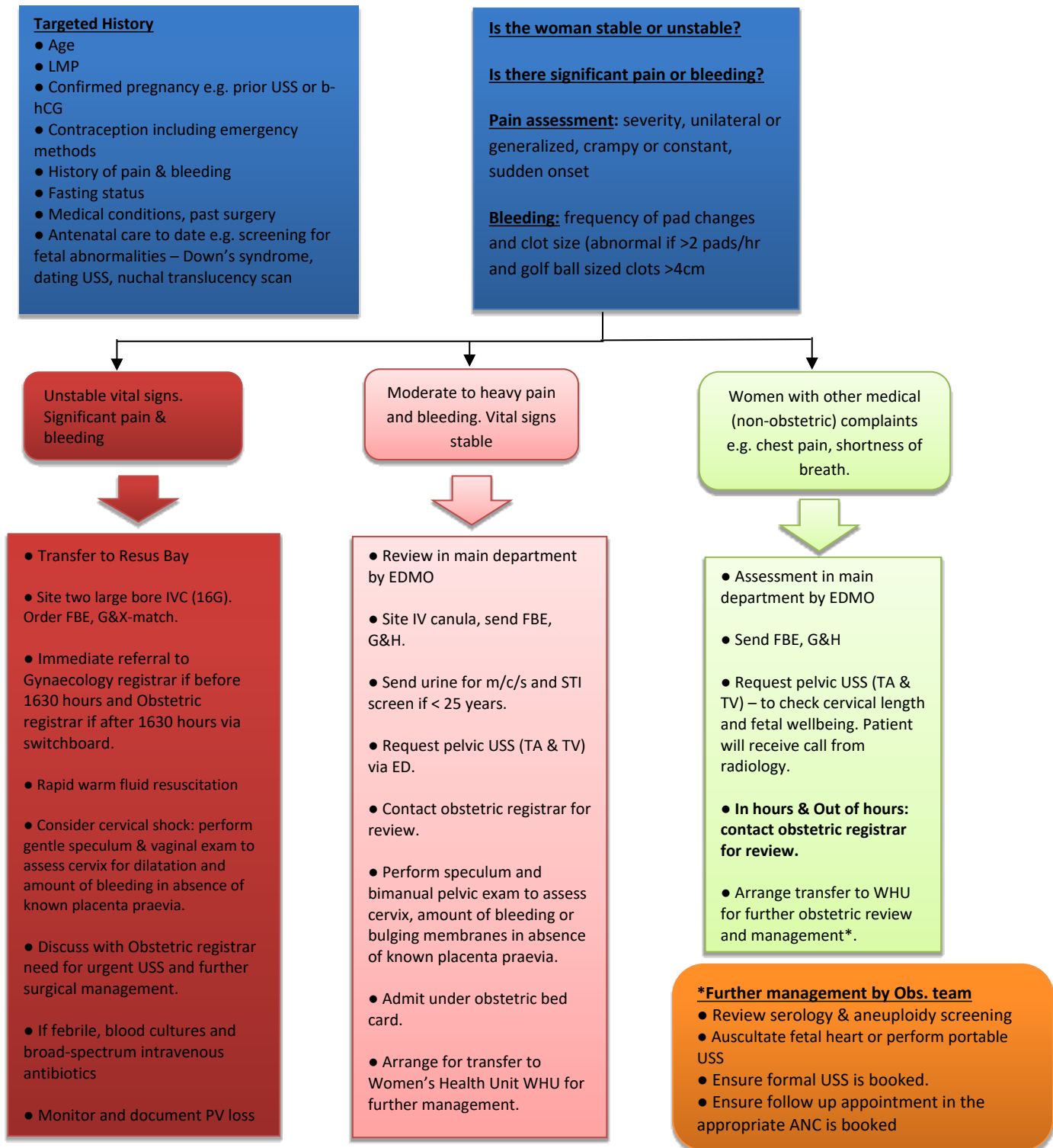
Flowchart B: Assessment Algorithm: Pain and Bleeding in ED \geq 16+0/40 weeks