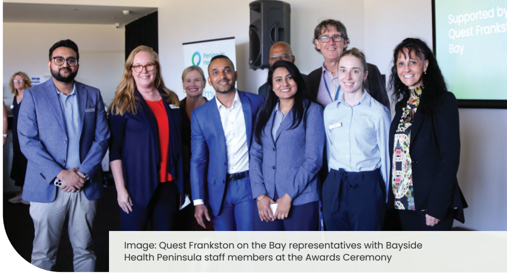
Image: Quest Frankston on the Bay representatives with Bayside Health Peninsula staff members at the Awards Ceremony

The ceremony was sponsored by Quest Frankston on the Bay, whose generous support helped bring the event to life and made the day possible for all our graduates. The event recognised learners who completed programs across nursing, midwifery, allied health, pharmacy, medical imaging,