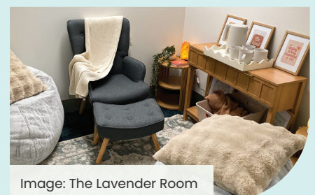
Image: The Lavender Room