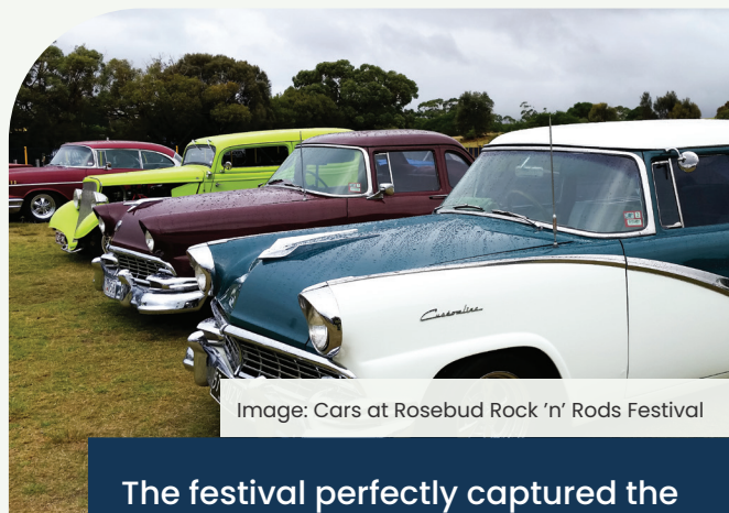
Image: Cars at Rosebud Rock 'n' Rods Festival

This non-invasive ventilation device delivers high flow, warmed and humidified oxygen to patients who are breathing spontaneously but require additional respiratory support. The Airvo 3 plays an important role in improving patient comfort and breathing efficiency, supporting better clinical outcomes when it matters most.