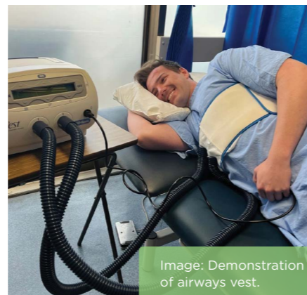
Image: Demonstration of airways vest.